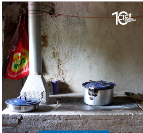
CASE STUDY | JUNE 2018 PROMOTING SUSTAINABLE BUSINESS MODELS FOR CLEAN COOKSTOVES DISSEMINATION IN HONDURAS

CIF has entered into a learning partnership with the Global Delivery Initiative (GDI) as part of an effort to showcase CIF project-level results and lessons learned.