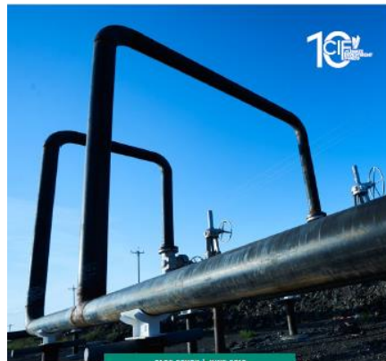
CASE STUDY | JUNE 2018 GEOTHERMAL ENERGY POWERING KENYA'S FUTURE Menengai Geothermal Field Development Facilitated by Public-Private Partnerships

GDI is a collaborative effort to create a collective evidence of delivery know-how.