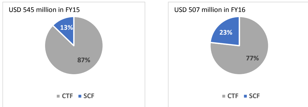
Figure 3: Shares in the annual disbursement (for FY15 and FY16)

7. The cumulative CIF disbursement ratio 4 has continued to trend upward as disbursements have been exceeding new project and program approvals. The disbursement ratio at the end of FY16 was 38%, an increase of 7 percent over FY15. This ratio is expected to increase further as the number of disbursing projects increases and the implementation of projects progresses.