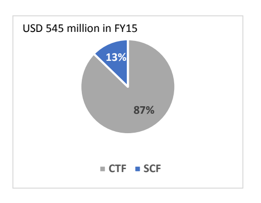
Figure 3: Shares in the annual disbursement (for FY15 and FY16)

6. Although CTF accounts for a greater portion of the CIF's overall disbursements (86% share; USD 1,702 million out of USD 1,973 million), there is an encouraging sign in the SCF Programs which have doubled its share in the CIF's overall annual disbursements from 13% in FY15 to 23% in FY16 (Figure 3). The increase is mainly driven by the PPCR and FIP programs with the PPCR's annual disbursements increasing from USD 45.9 million in FY15 to USD 78.9 million in FY16, and the FIP's annual disbursements increasing from USD 12.8 million to USD 26.8 million in the same periods (for the details, please refer to each program's ORR).