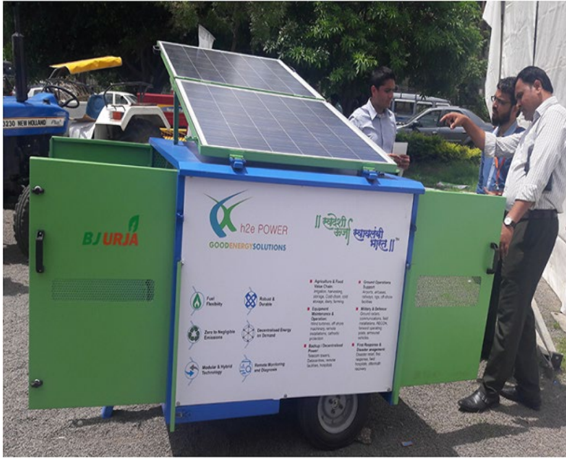
Information and Photo Courtesy: h2e power