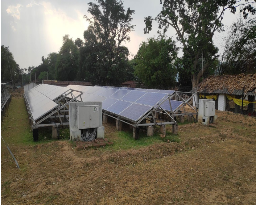
Information and Photo Courtesy: Minda