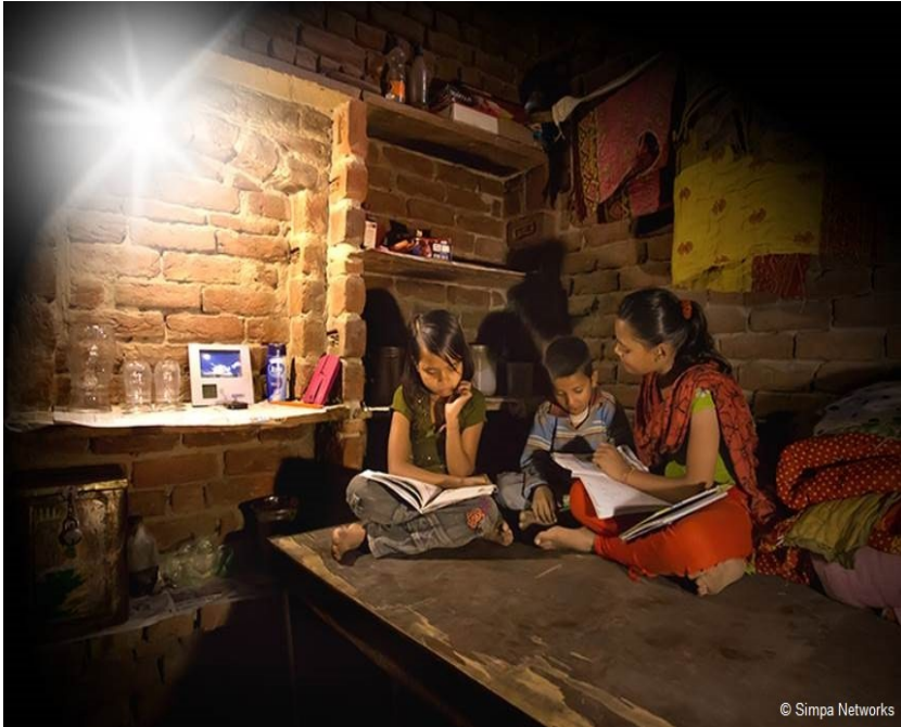
Information and Photo Courtesy: Simpa