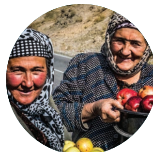
TWO RECIPIENTS OF PPCR FUNDED CLIMADAPT, A CLIMATE RESILIENCE FINANCING FACILITY, IN TAJIKISTAN

CIF has moved toward gender-equal participation in, and benefits from, CIF interventions. The strongest results are in Strategic Climate Fund programs. CIF investment plans and projects (e.g., in Cambodia, Lao PDR, and Nepal) increasingly include in-depth gender analysis, women-specific activities, and sex-disaggregated monitoring and reporting. There are interim signals of systemic change regarding gender-responsive design and institutional changes, as well as market-related outcomes, which might lead to scaling.