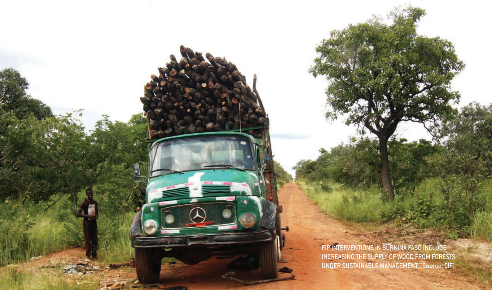
FIP INTERVENTIONS IN BURKINA FASO INCLUDE INCREASING THE SUPPLY OF WOOD FROM FORESTS UNDER SUSTAINABLE MANAGEMENT.