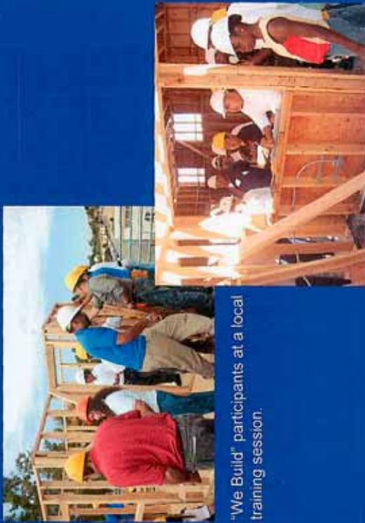
"We Build" participants at a local training session.